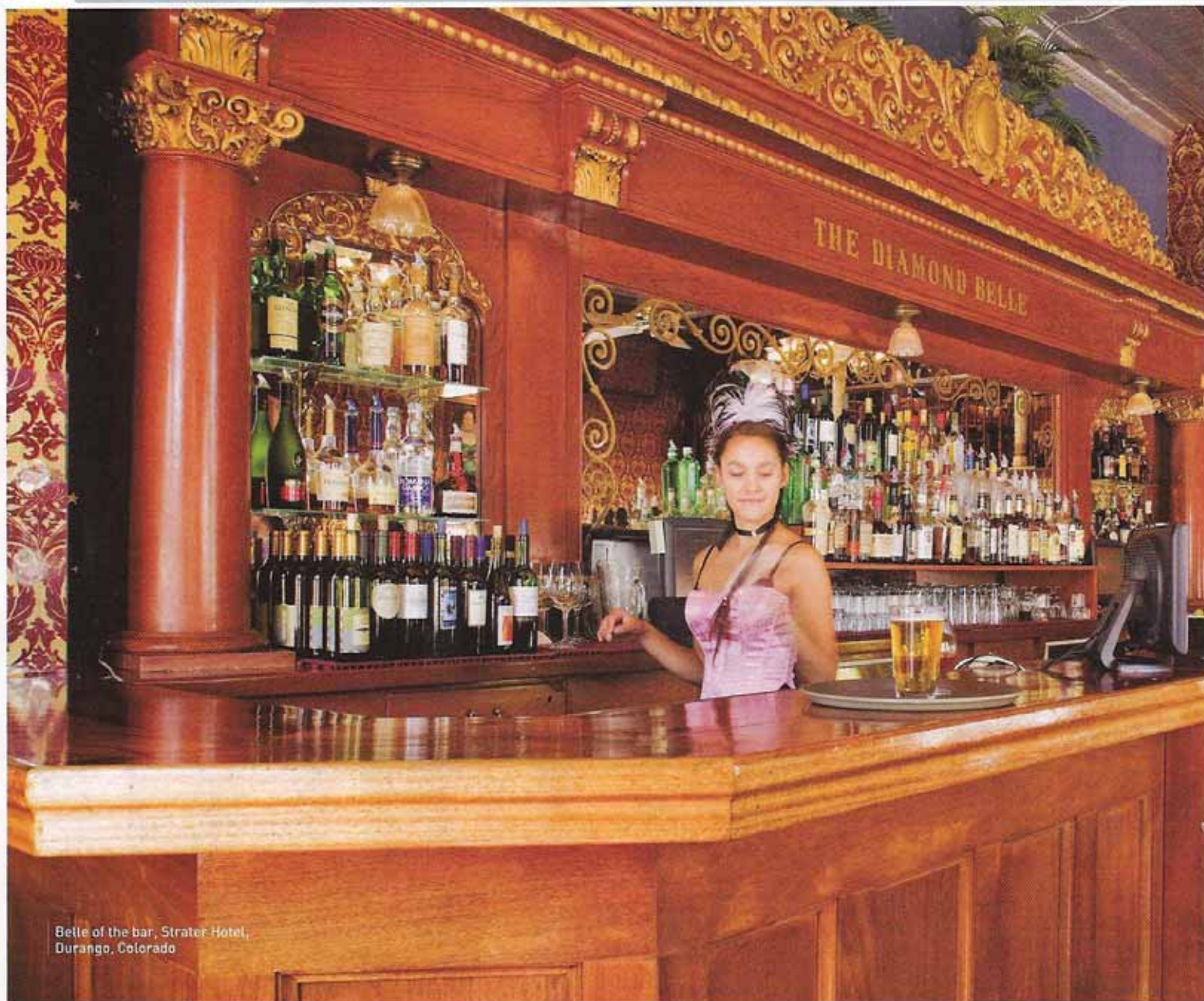
Belle of the bar, Strater Hotel, Durango, Colorado